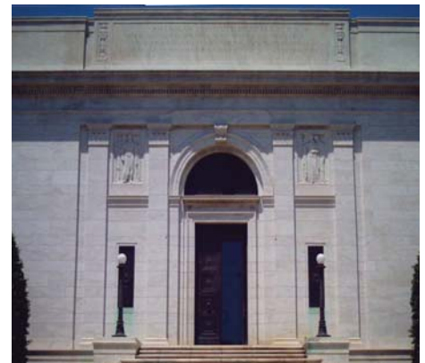
American Pharmacists Assn.