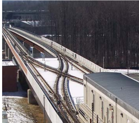
N.Y. Ave. Metro Station