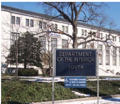
U.S. Department of the Interior