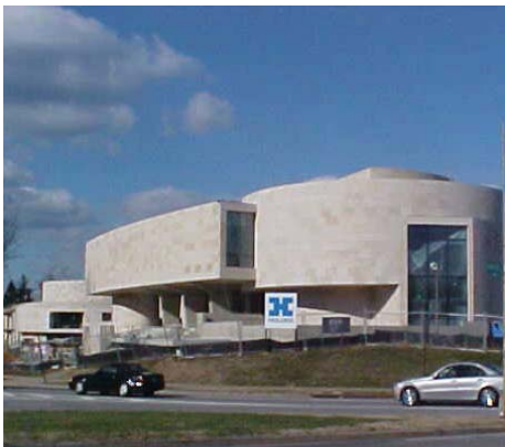
Katzen Arts Center